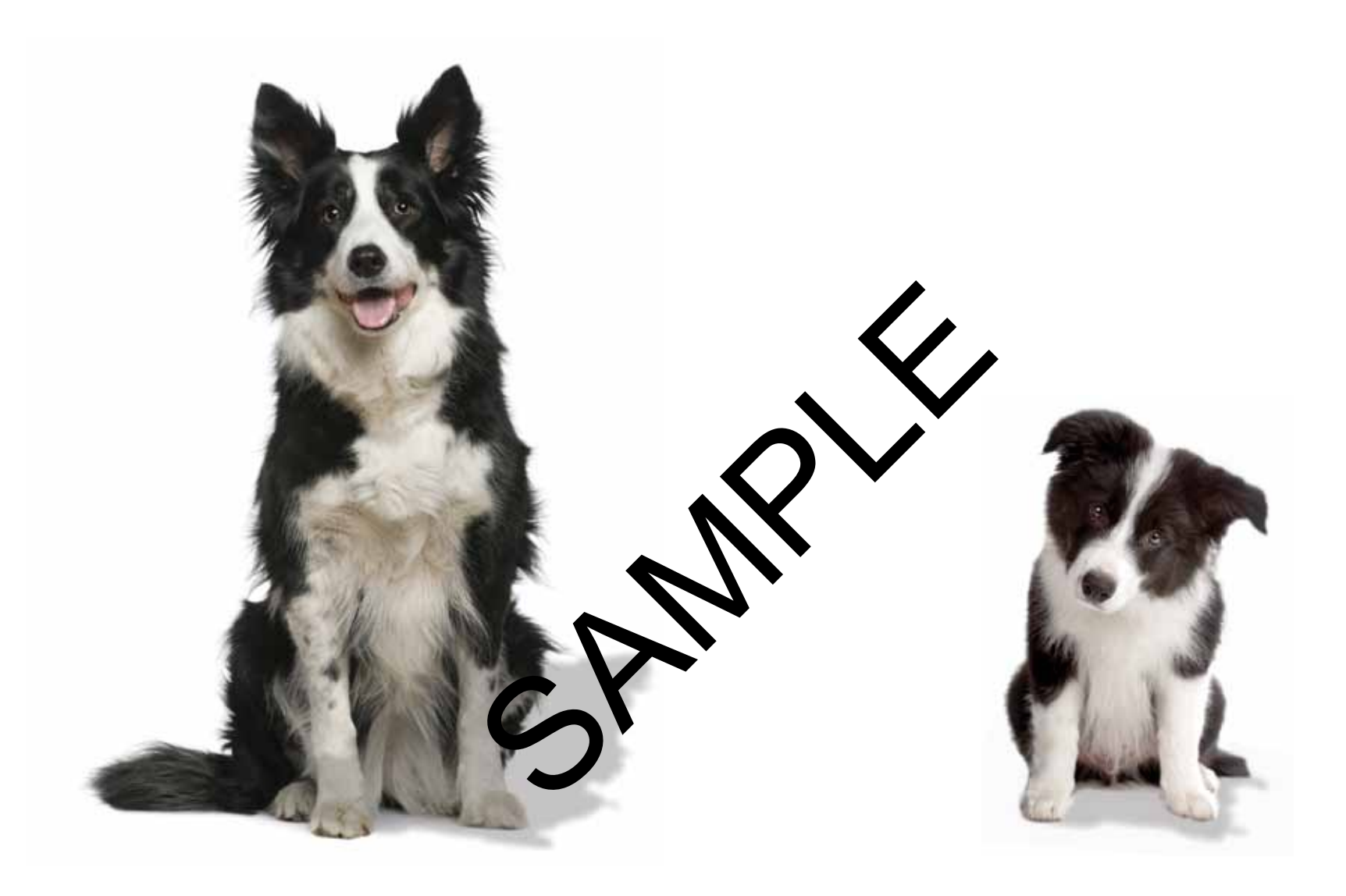
This is big.